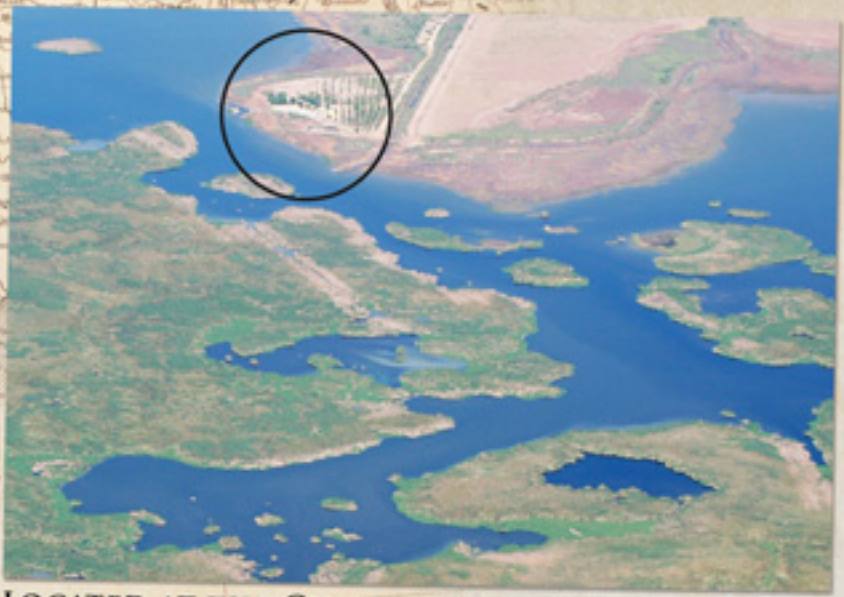
LOCATED AT THE CHIRICAHUETO LAGOON, MEXICO