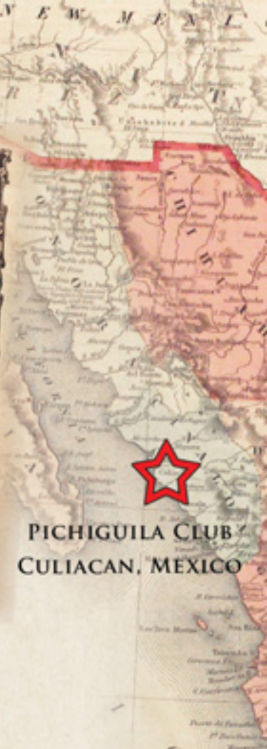
PICHIGUILA CLUB CULIACAN, MEXICO