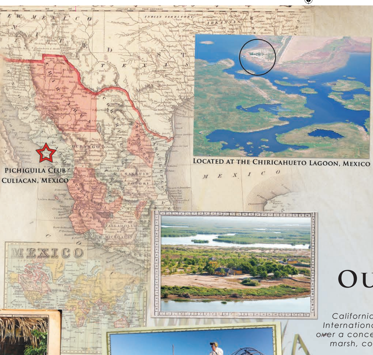
PICHIGUILA CLUB CULIACAN, MEXICO